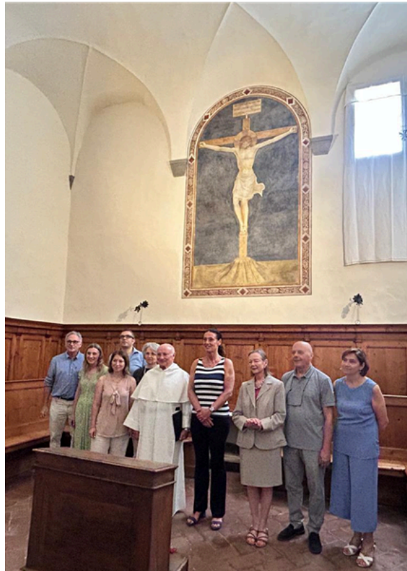
Crucifixion, 1433-34. Chapter House, Convent of San Domenico, Fiesole, Italy. Presentation after 2025 restoration with support from Friends of Florence Foundation.