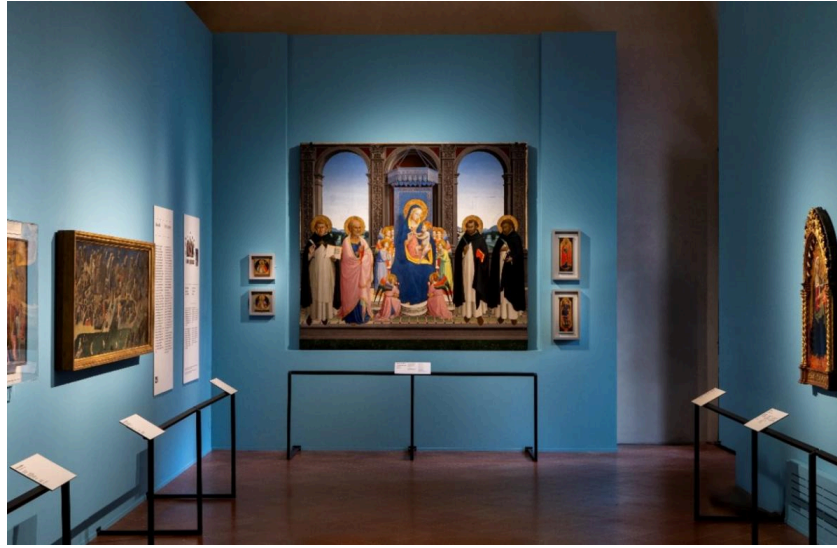
San Domenico Altarpiece (Fiesole Altarpiece), 1420-1423; 1501. Main panel with Madonna and Child enthroned with eight angels and Saints Thomas Aquinas, Barnabas, Dominic, and Peter Martyr. Installation view in the Fra Angelico exhibition, Palazzo Strozzi and Museo di San Marco, Florence, Italy, September 26, 2025 - January 25, 2026.