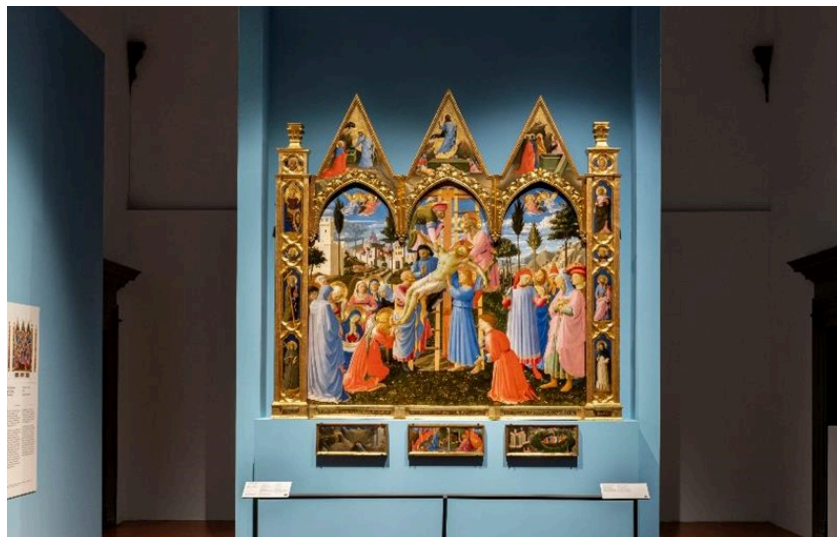
Santa Trinita Altarpiece (Deposition from the Cross), 1429-1432. Installation view in the Fra Angelico exhibition, Palazzo Strozzi and Museo di San Marco, Florence, Italy, September 26, 2025 - January 25, 2026.