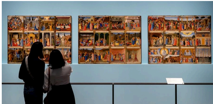
Armadio degli Argenti (Cabinet for the Silver Votives at Santissima Annunziata), c. 1450. Installation view in the Fra Angelico exhibition, Palazzo Strozzi and Museo di San Marco, Florence, Italy, September 26, 2025 - January 25, 2026.