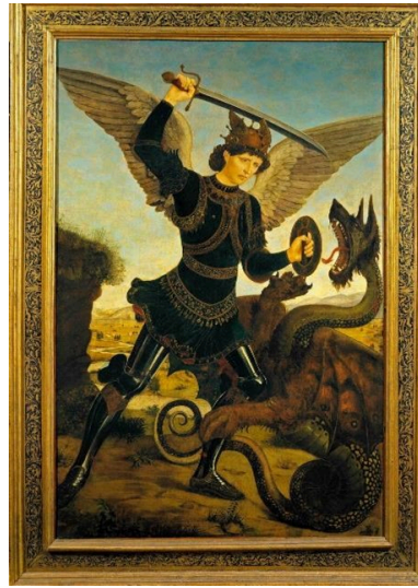
Piero del Pollaiuolo (1431-1498), St. Michael the Archangel and the Dragon (1460-1465). Museo Stefano Bardini, Florence, Italy.

The painting portrays the Archangel in armor fighting the Devil, depicted as a dragon. We know from Giorgio Vasari's Lives (1568) that the painting was originally one of a two-side processional banner made for the Company of St. Michael the Archangel in Arezzo. Unfortunately, the other side representing the Crucifixion is lost.